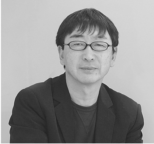
Toyo Ito "Architect", Japan

At this moment a mail has arrived from Tokyo providing more information about Toyo Ito and an actual photo which I enclose here.