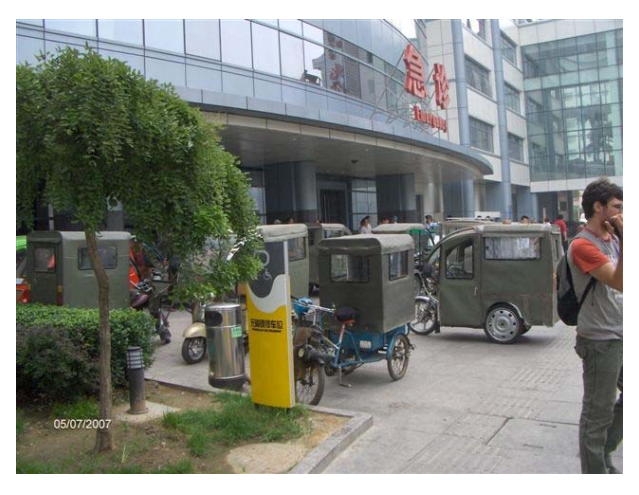
The Beijing Friendship Hospital, with rickshaw's for the patients

The Second Inpatient Department of the First Hospital of the Beijing University has 531 beds. Mostly 2-bed rooms and 10% 1-bed rooms. The 1 and 2-bed rooms have the same size. Normal room costs are 400 RMB (€ 40) per day. Larger rooms at the corner cost 800 RMB.