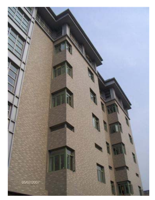
The First Hospital of the Beijing University. Second Inpatient Department

Thursday and Friday were planned for some hospital visits. We visited the First Hospital of the Beijing University and the Beijing Friendship Hospital on Thursday and the Teda Hospital in Tianjin on Friday.