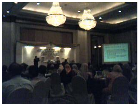
The Conference at the Concorde Hotel, Alam, Selangor

The first three days were filled with lectures. The workshop on formulation of briefs was held at night. Each group was made up of multidisciplinary professionals. They were given different departments to work on. The final day ended with the group presentation of the brief. The group was also brought for a hospital visit to 600 bed Sg. Buloh Hospital, Selangor. My role was the organizer for the university and speaker at three sessions.